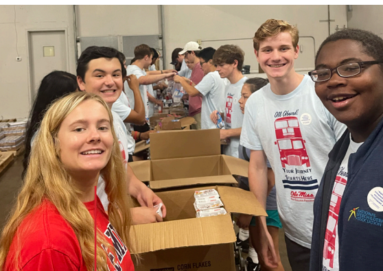
Students have the opportunity to complete a service project.