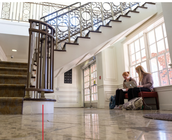
Rising 9th graders are offered a taste of college life on the campus of the University of Mississippi